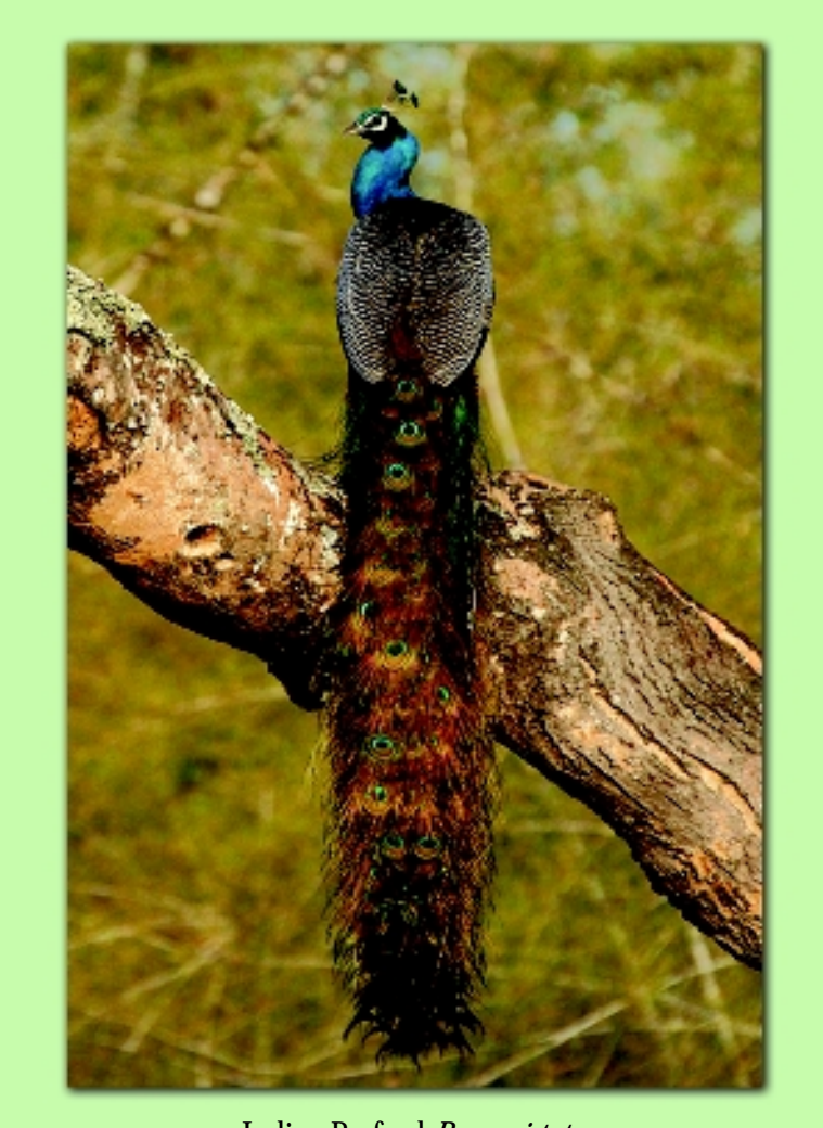
Indian Peafowl Pavo cristatus